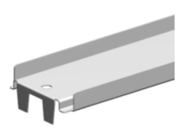
B = BOTTOM RAIL